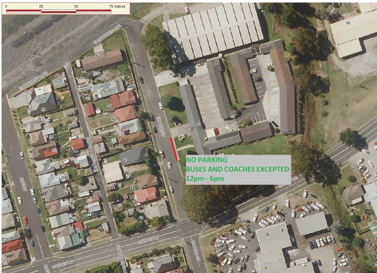
Example of a 'No Parking sign' with 'Buses & Coaches Excepted'

Residents and landowners on this section have been consulted with details of the proposal and given the opportunity to provide comment. The consultation period finishes Wednesday 15 March 2018. Only one response was received during the period.