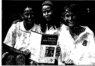
Guidance: The Waalkens children of Coogee with the booklet