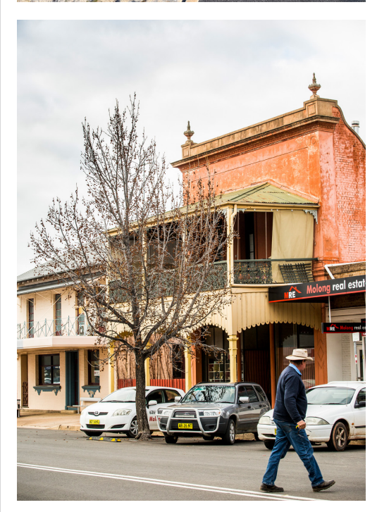
From top: Locals enjoy bikes trails in Parkes. Cringilla Pump Track. The historic village of Molong.