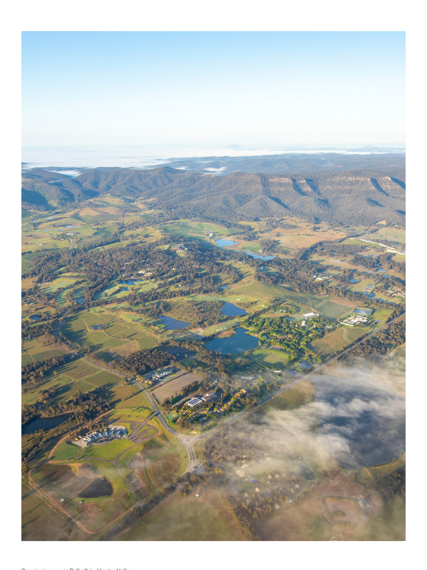
Scenic views over Polkolbin, Hunter Valley.