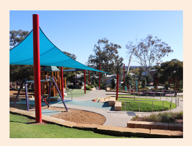
Bridges Hill Park Playground, Cessnock.