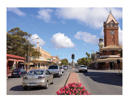
From top: Aerial view of Helensburgh. Maitland. Westbound view of Broken Hill's Argent Street.