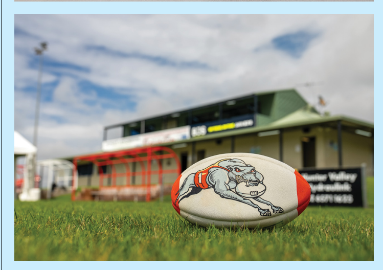
From top: Local sports fields in Maitland. Tree lined streetscape in Mudgee's town centre. Singleton Rugby League Club.