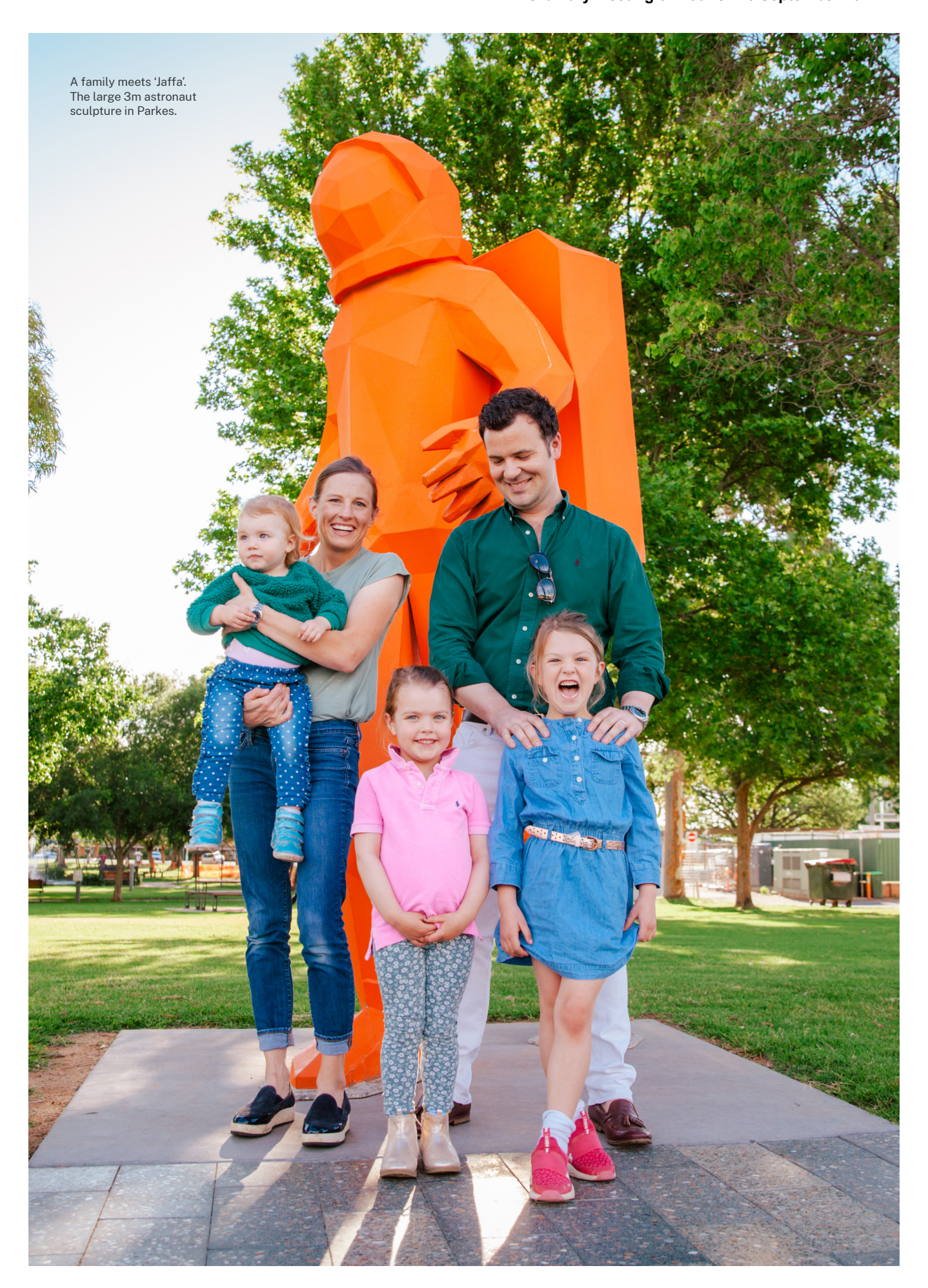
Page 14 of 34