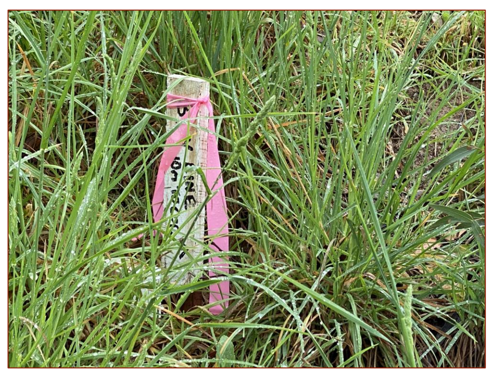
Survey Peg In-ground Noted