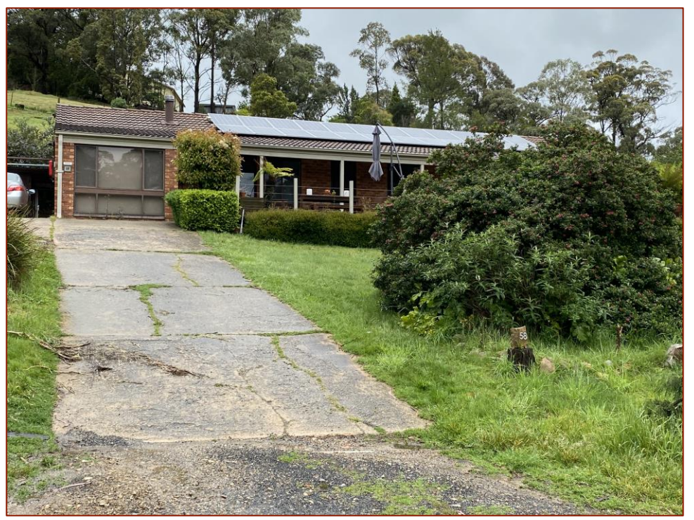
Residential Improvements on the Parent Site