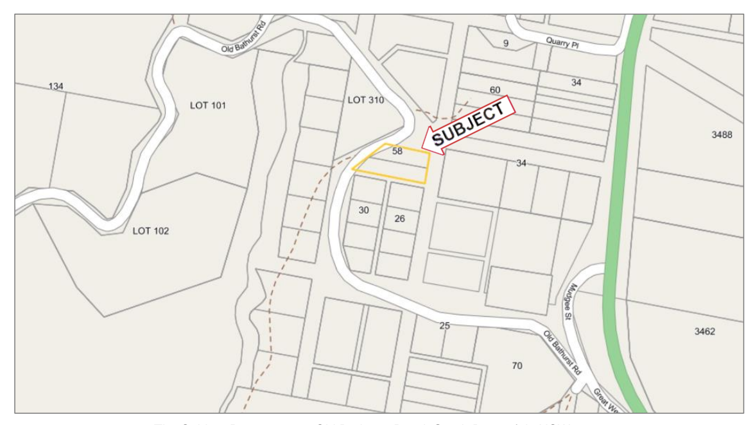
The Subject Property – 58 Old Bathurst Road, South Bowenfels NSW 2790