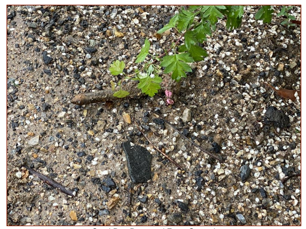
Steel Peg Removed From Ground