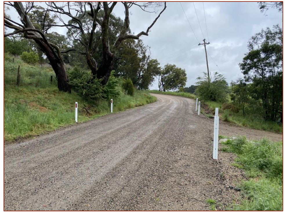
General View of the Subject Land