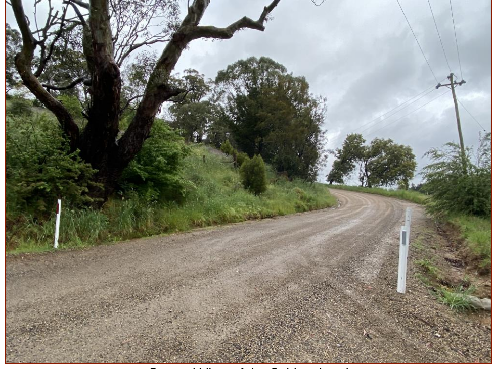
General View of the Subject Land