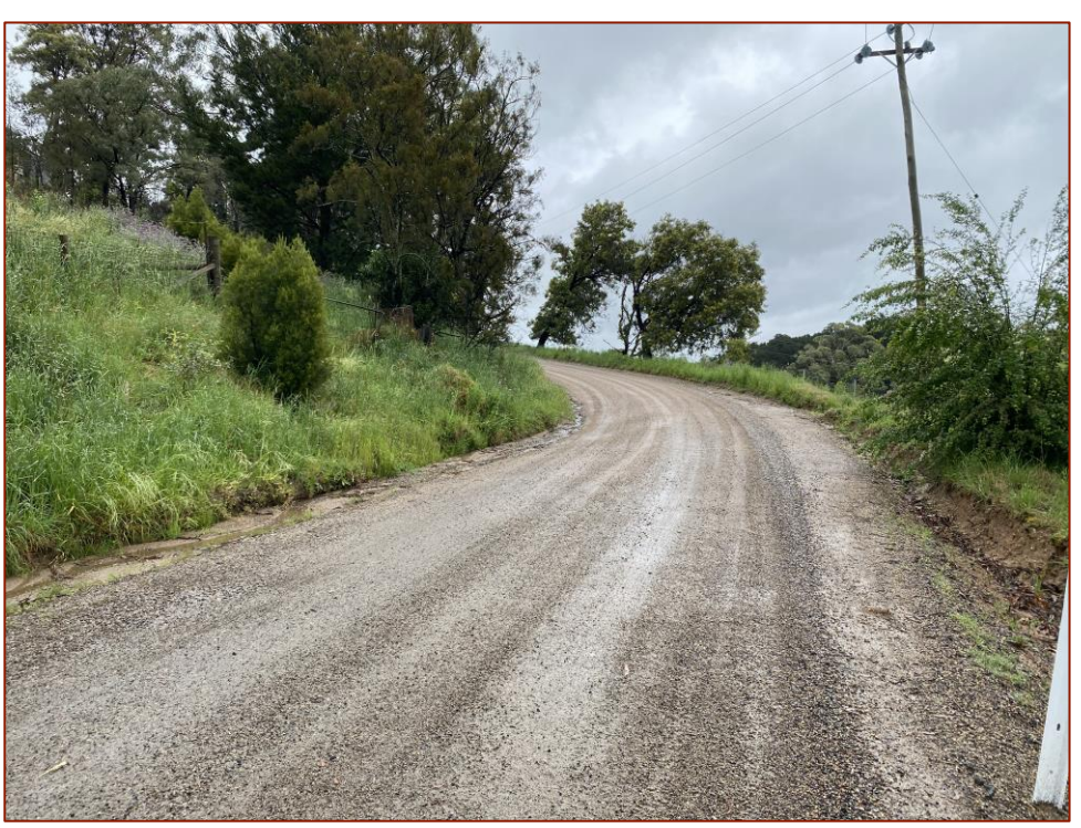
General View of the Subject Land