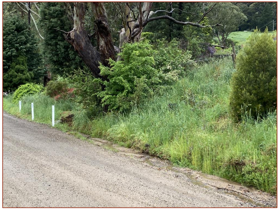
General View of the Subject Land