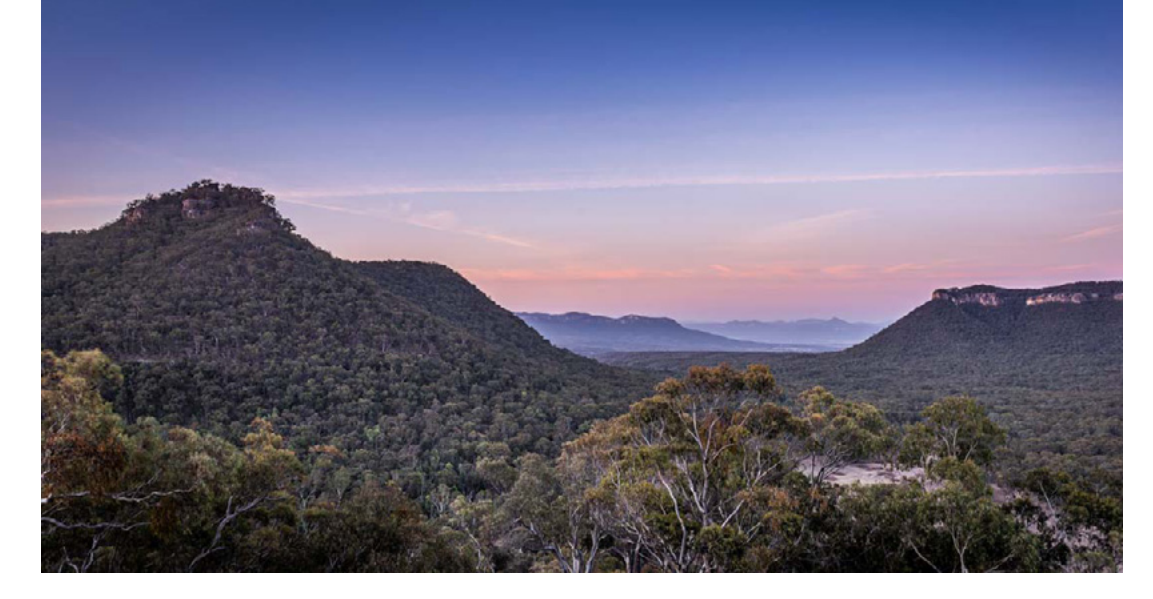
Left: Gardens of Stone National Park