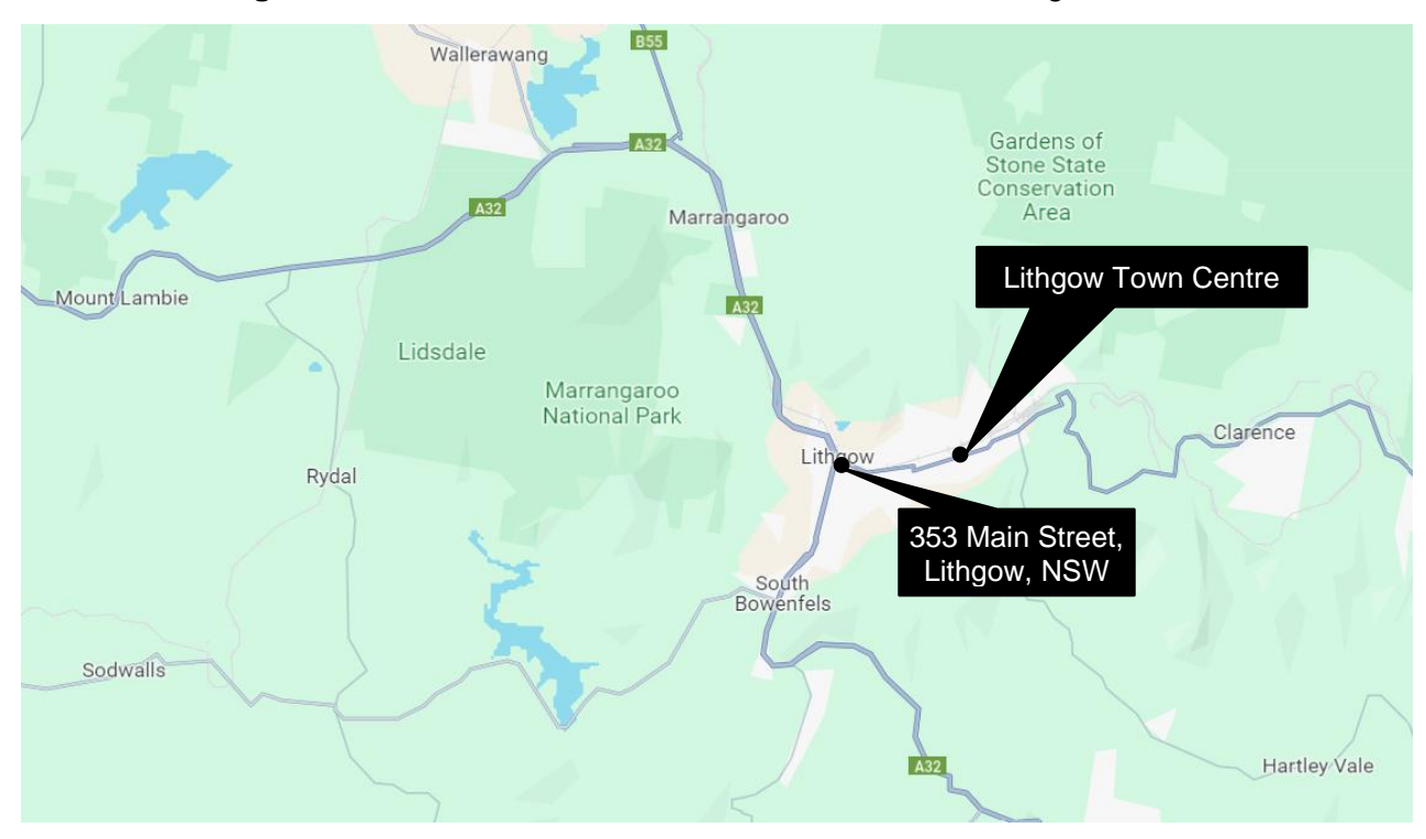
Figure 3-1: Site Location

The site is located at 353 Main Street, Lithgow, NSW, approximately 1 km west of the Lithgow Town Centre. Figure 3-1 shows the location of the site in relation to Lithgow Town Centre..