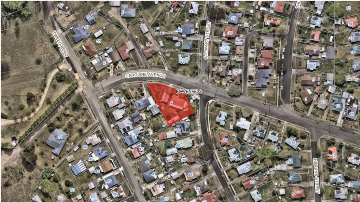
Fig 1 - Aerial photo showing development within the vicinity and lack of similar large garage developments