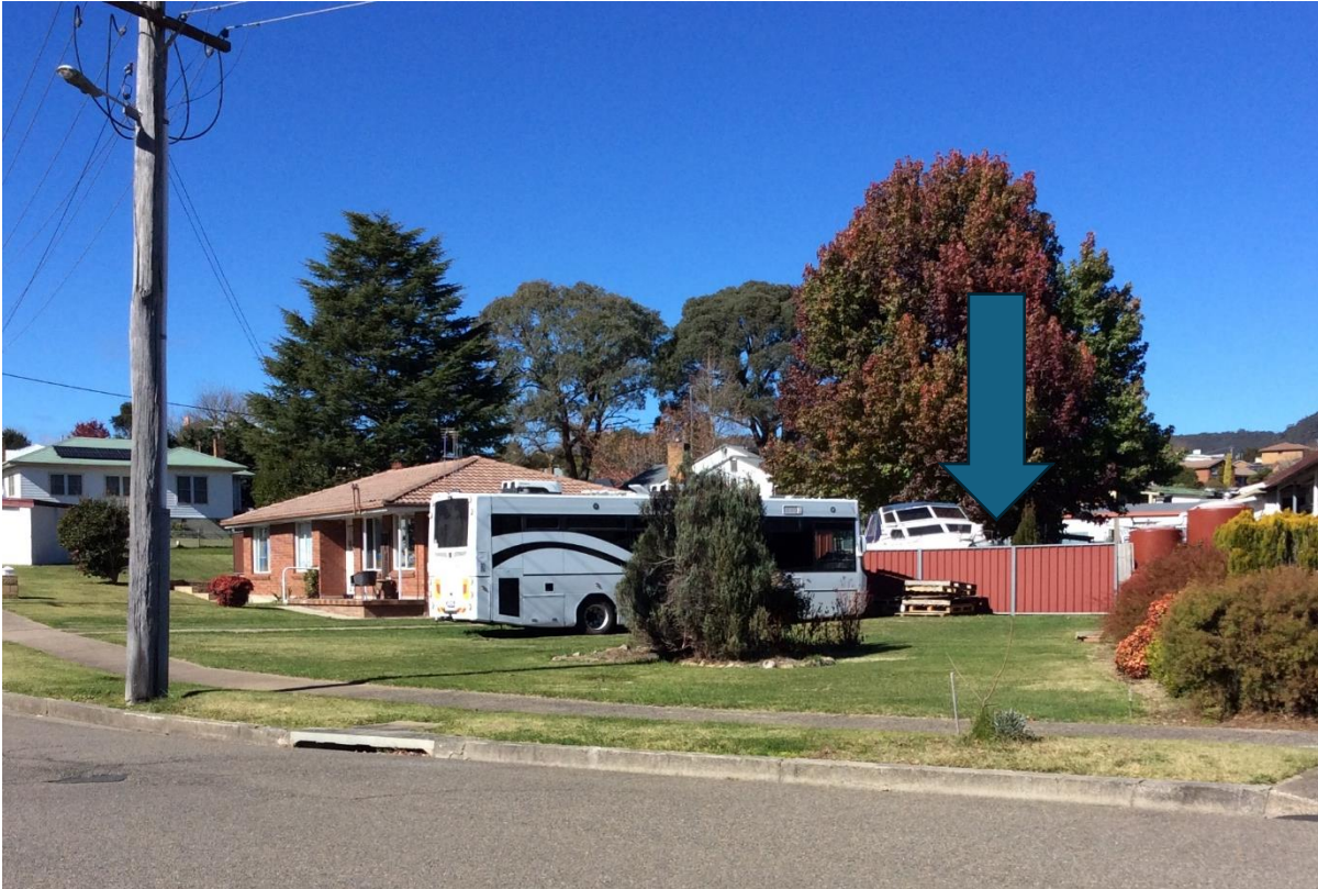
Fig 5: Photo of showing location of proposed garage