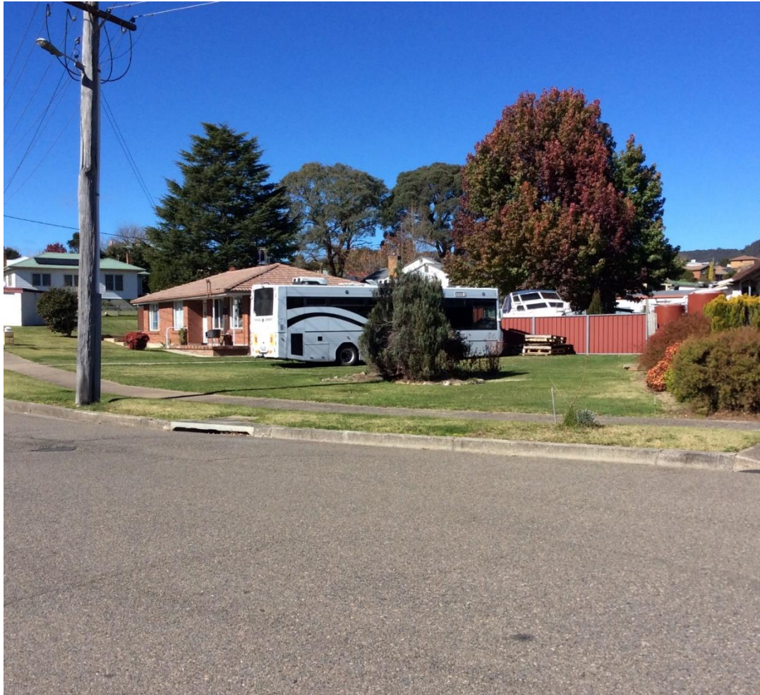
Fig 6: Photos showing height of the existing motor home vehicle in relation to residences nearby