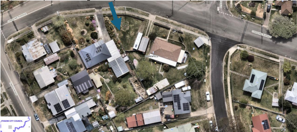
Fig 2: More detailed aerial photo of site (arrow indicates approximate location of proposed garage /shed)