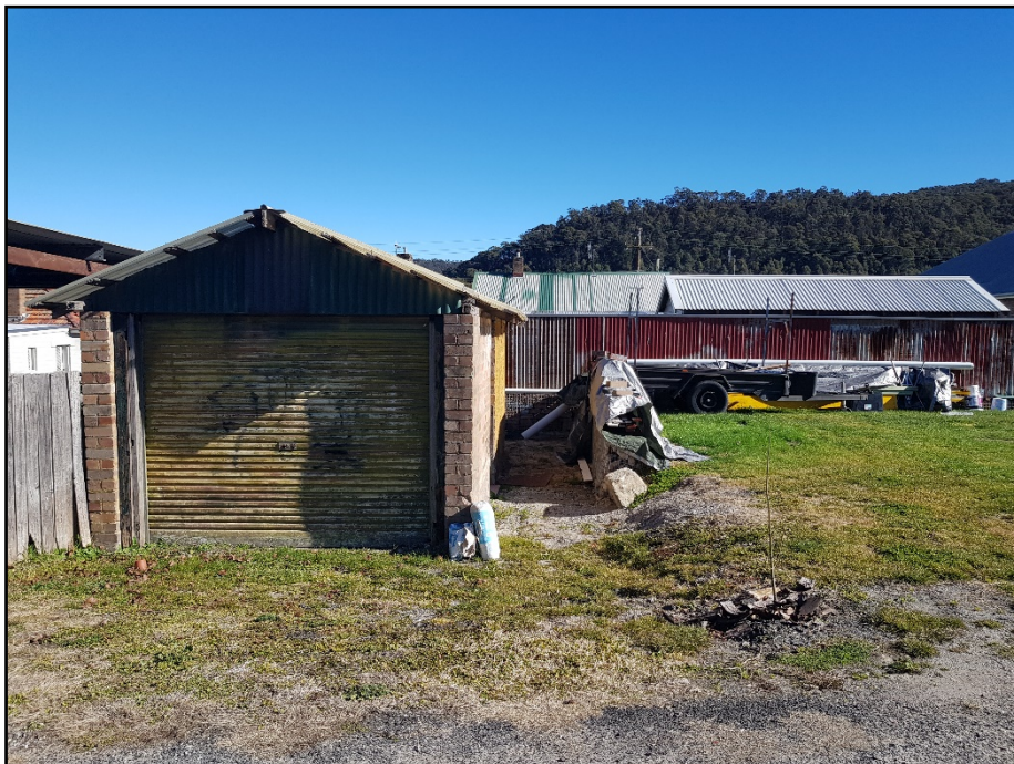
Image 1 – Site of proposed development including shed to be demolished

The property is relatively flat land as shown in Image 1 below.