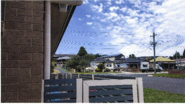
Line of sight looking towards Inch Street when reversing from garage.