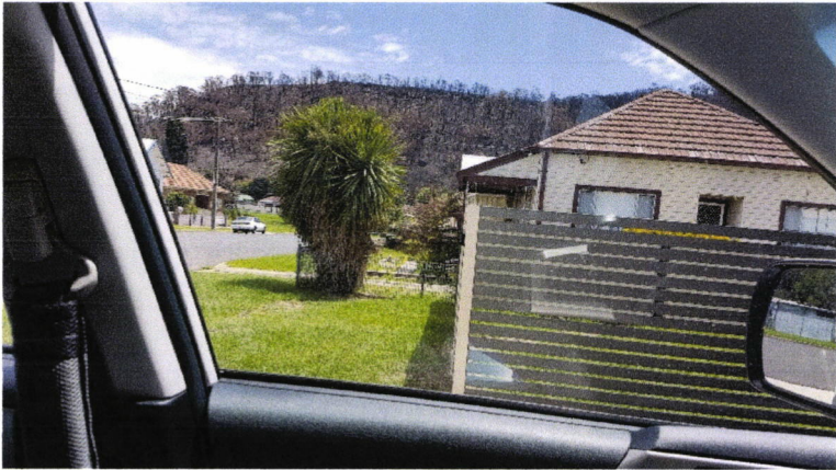
Line of sight towards creek when reversing from garage.