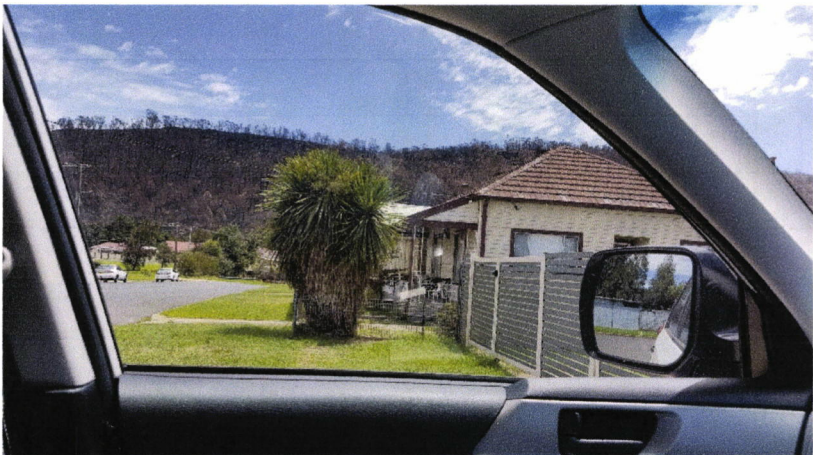
Line of sight when looking towards creek is not clear until vehicle is directly on what would be shared pathway

Photographs taken on 5 February 2020 – property 174 Inch Street, Lithgow. Access to garage from Burton Street.