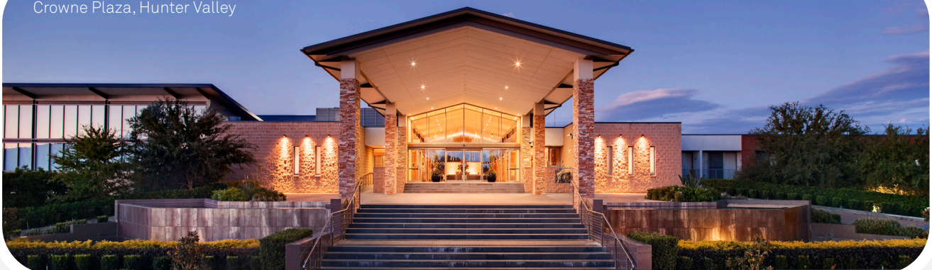
Crowne Plaza, Hunter Valley

If you are posting about the LGNSW Annual Conference on social media, please use the hashtag #lgnsw2020 .