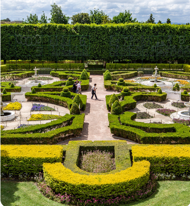
Hunter Valley Gardens, Pokolbin

The AR Bluett Memorial Trustees will also present the prestigious AR Bluett Awards during the business program to councils that have been recognised as the most progressive in NSW in 2019/20. Widely acknowledged as the greatest accolade a council can achieve, this will be the 76th year for which the awards have been presented. Award recipients will need to register for the Ministers Forum and Welcome Reception and purchase a ticket.