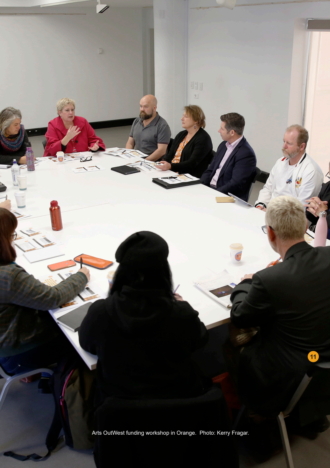
Arts OutWest funding workshop in Orange.