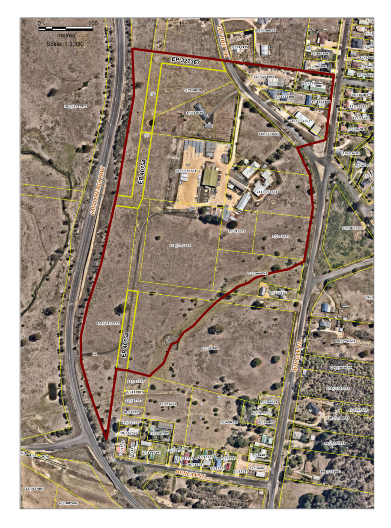
Figure 1 IN2 Investigation Area