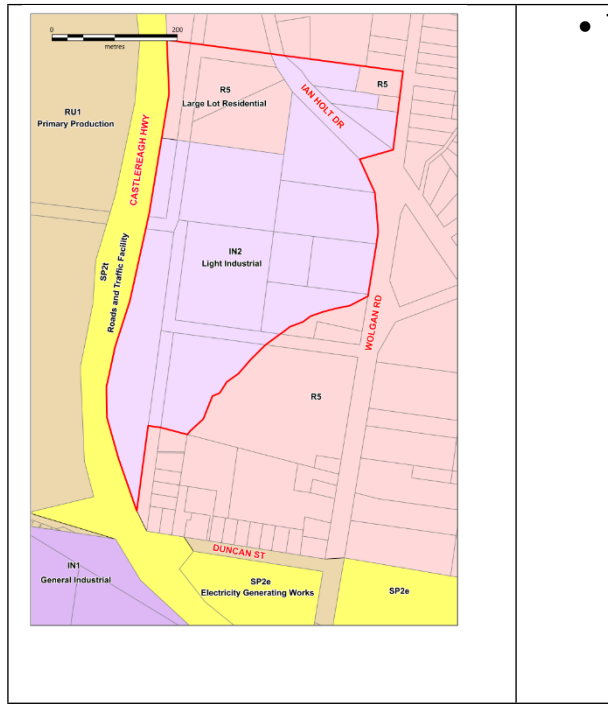
• This option limits zoning change to those properties that are currently not developed for any IN2 land use.

Option 4 presents as the preferred option being of minor local significance and the option that would most likely be carried through to a Gateway Determination.