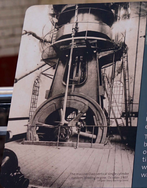
The massive Davy vertical single cylinder tandem blowing engine, October 1907.