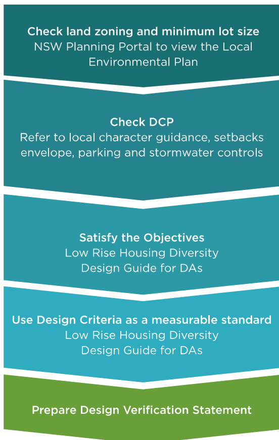
Figure 2-35 Workflows: Preparing a DA

Section 3 provides explanatory guidance to assist with the interpretation of terms used in this Section.