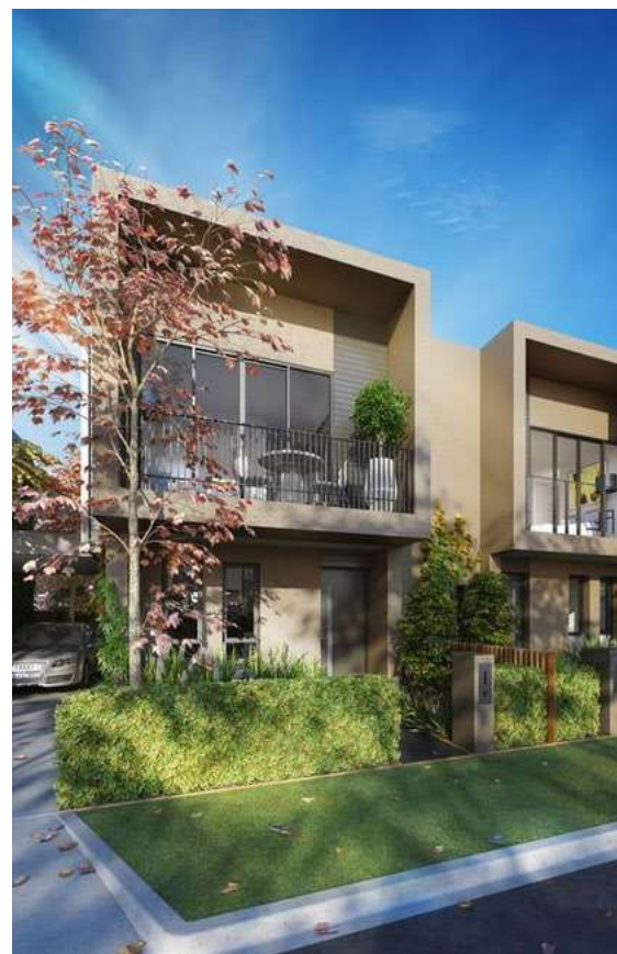
Figure 2-29 Dual occupancy (side by side)

Section 3 provides explanatory guidance to assist with the interpretation of terms used in this Section.