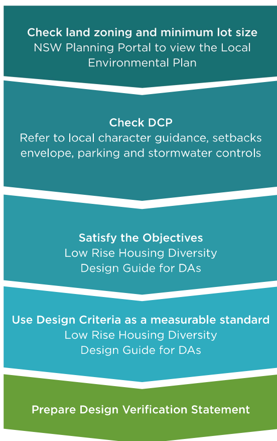
Figure 2-33 Workflows: Preparing a DA

Section 3 provides explanatory guidance to assist with the interpretation of terms used in this Section