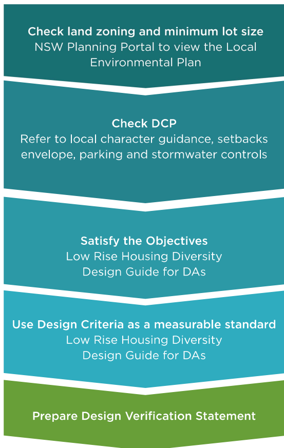
Figure 2-31 Workflows: Preparing a DA

Section 3 provides explanatory guidance to assist with the interpretation of terms used in this Section.