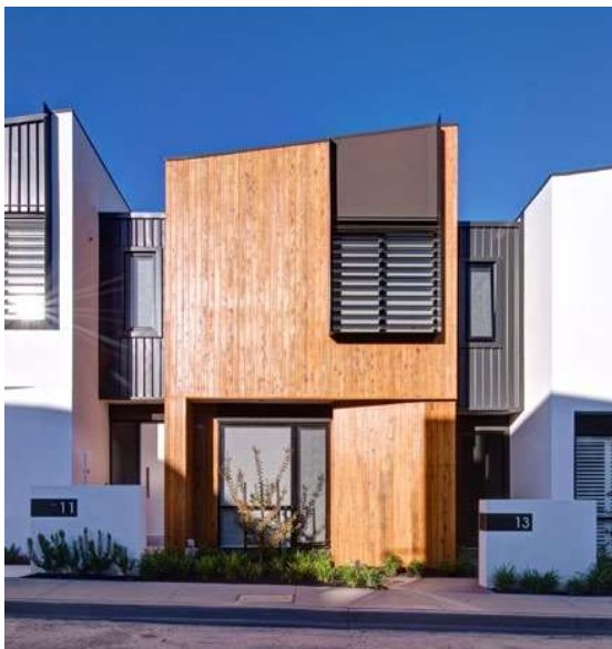
Figure 2-32 Multi dwelling (terraces)

Multi dwelling housing must be permissible on the lot on which the multi dwelling housing (terraces) development is proposed. The LEP that applies to the land will indicate if the development is permissible.