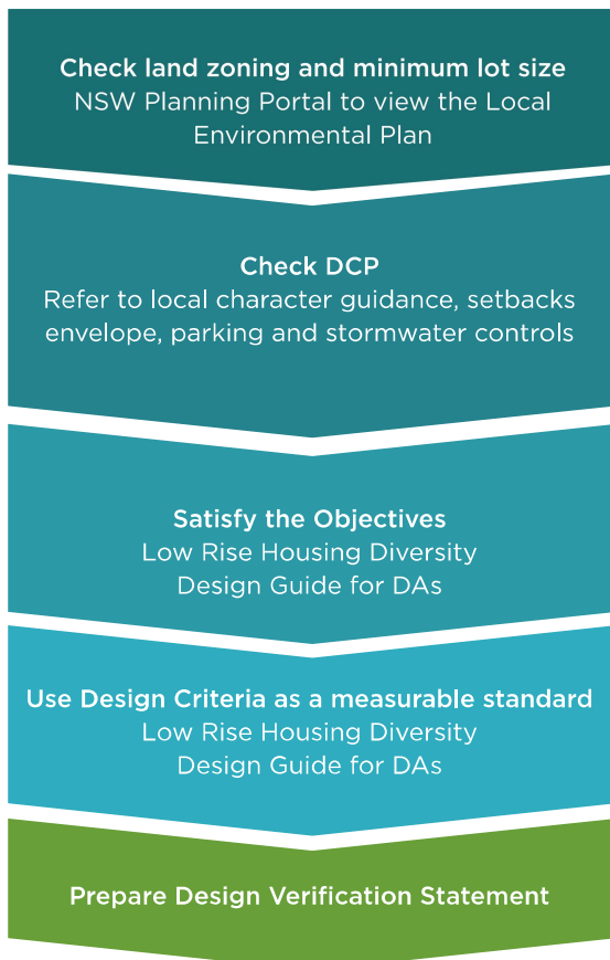
Figure 2-28 Workflows: Preparing a DA

A qualified designer or a building designer that is accredited by the Building Designers Association of Australia is to certify that the design of the development is consistent with the Design Criteria in the Design Verification Statement.