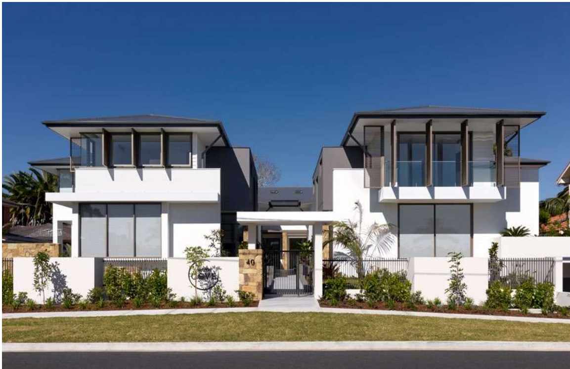
Figure 2-34 Multi dwelling housing

This form of development cannot be carried out as complying development. A development application is required for consent.