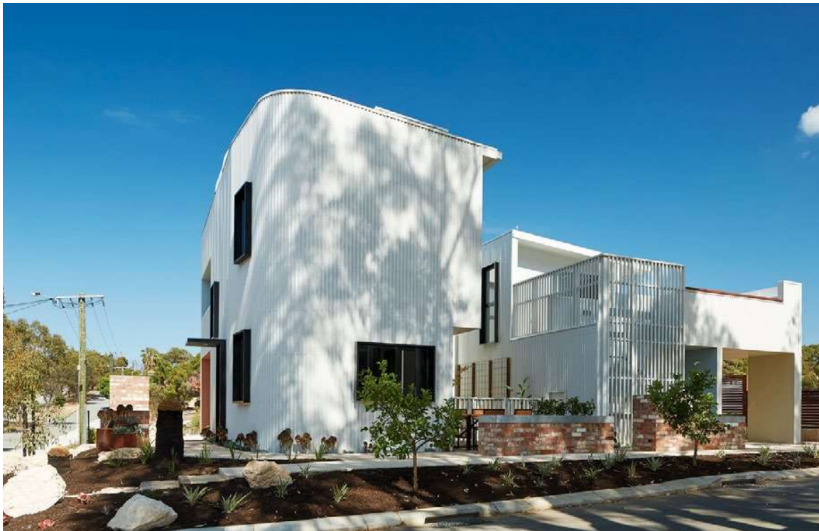
Figure 2-30 Manor House - 3 dwellings

The development type must be permissible on the land on which the development is proposed. The LEP that applies to the land will indicate if the development is permissible.