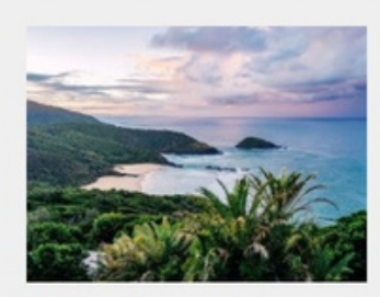
Guide: Prepare for bushfires and natural disasters

Each guide covers topics including managing people on-site and incoming visitors, staff and suppliers, emergency response, overcoming adversity and the overall visitor economy.