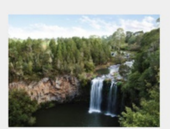
Quick Tips Guides for Tourism