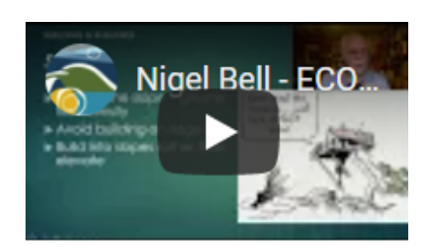
Nigel Bell - ECODesign Architects