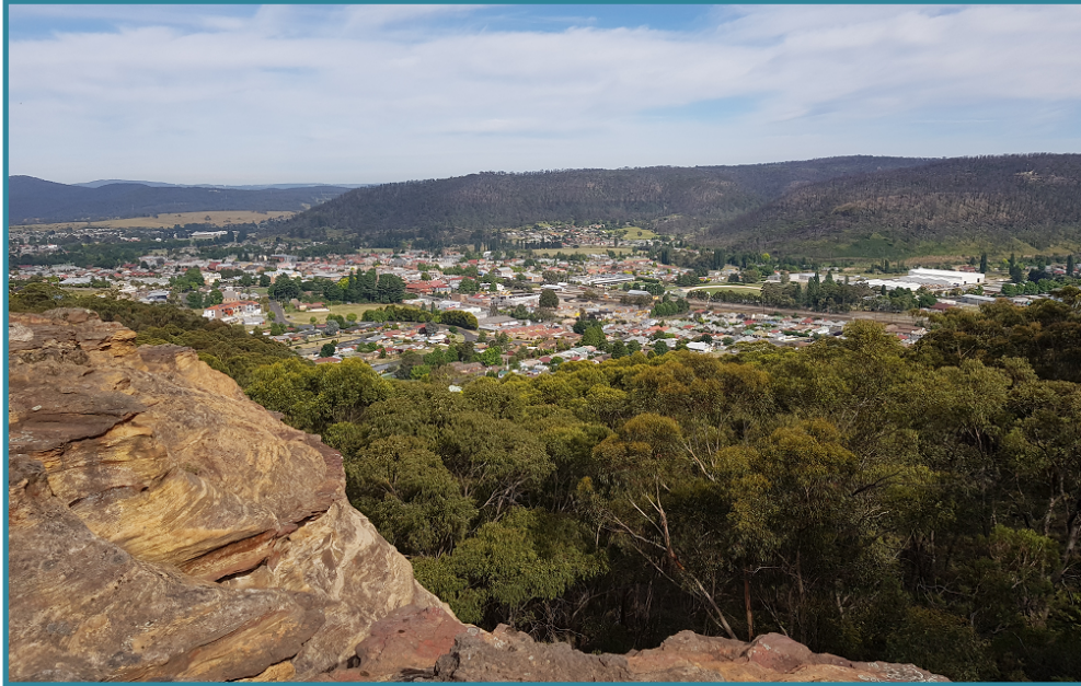
View of Lithgow from Bracey's Lookout