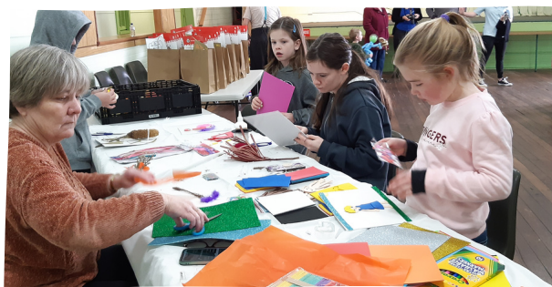
FAMILY FUN DAY!!