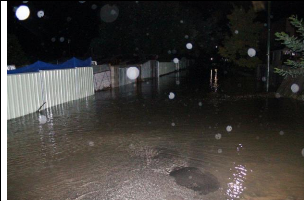
Plate 5 – Water ponding in Ramsay Street after flood peak.