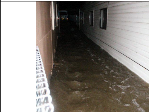
Plate 7 – Floodwaters between Nos. 61 and 63 Hartley Valley Road.