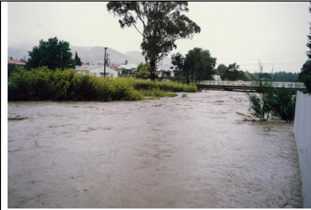
Plate 1 – Farmers Creek. View from rear of No. 47 Coalbrook Street looking downstream towards Albert Street.