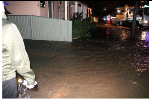
Plate 6 – Flooding in front of Nos. 63 and 65 Hartley Valley Road.