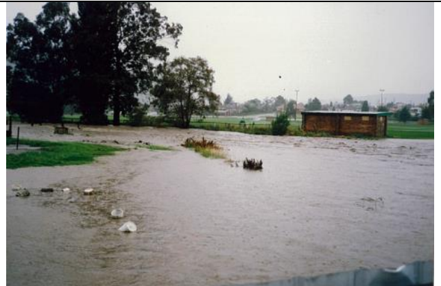
Plate 2 - View across Farmers Creek from No. 47 Coalbrook Street at Glanmire Oval.