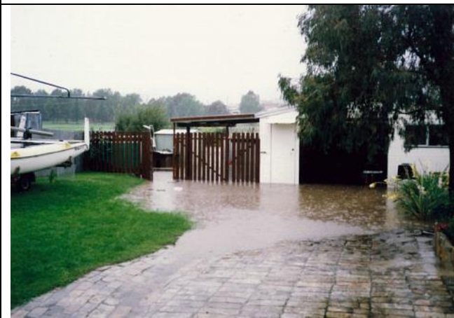
Plate 3 – Water ponding in the rear of No. 47 Coalbrook Street.