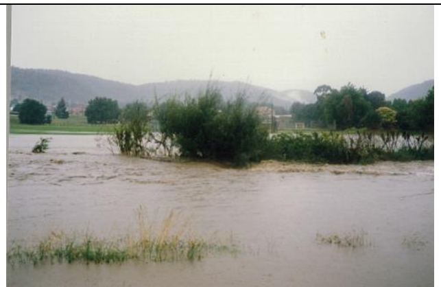
Plate 4 – Farmers Creek behind No. 47 Coalbrook Street.